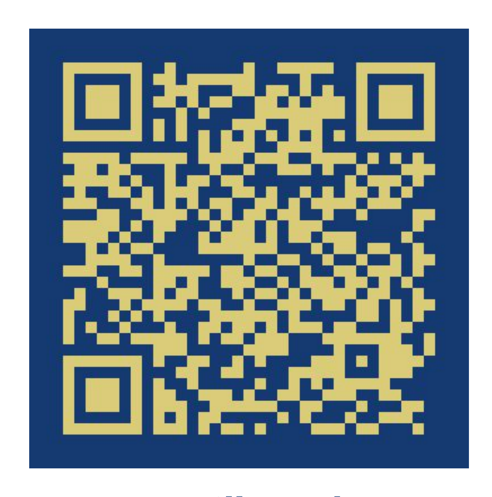
ULCT Bill Tracker