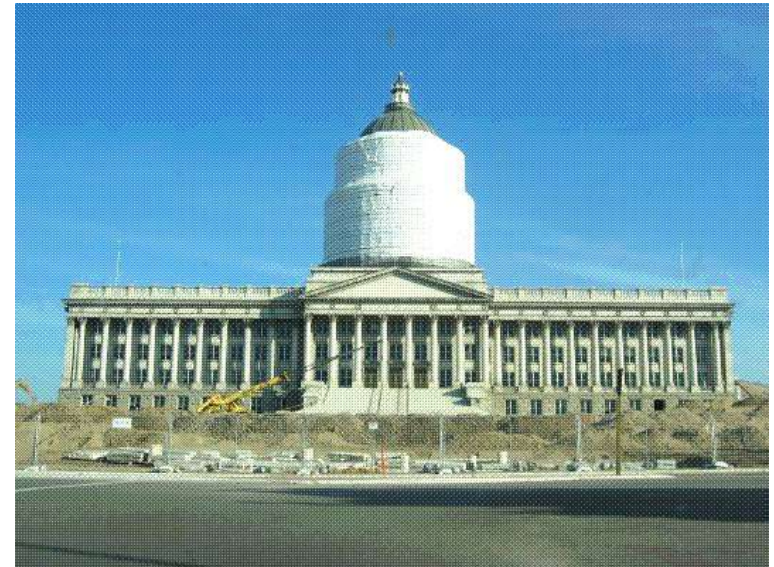
The 2006 Legislative Session